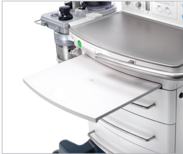
Pull-out work table