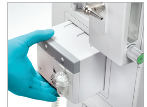
Integrated gas analysis