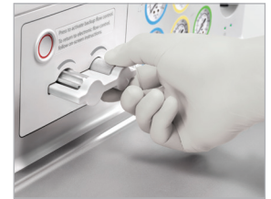
Backup gas (O 2 and Air)