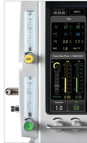
Auxiliary O 2 /Air