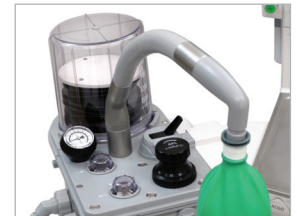
Flexible bag arm