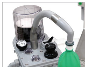
Flexible bag arm

Mindray North America 800 MacArthur Blvd., Mahwah, NJ 07430 Tel: 800.288.2121 Tel: 201.995.8000 Fax: 800.926.4275 www.mindray.com