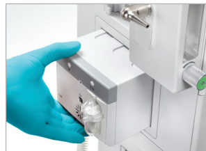
Integrated gas analysis