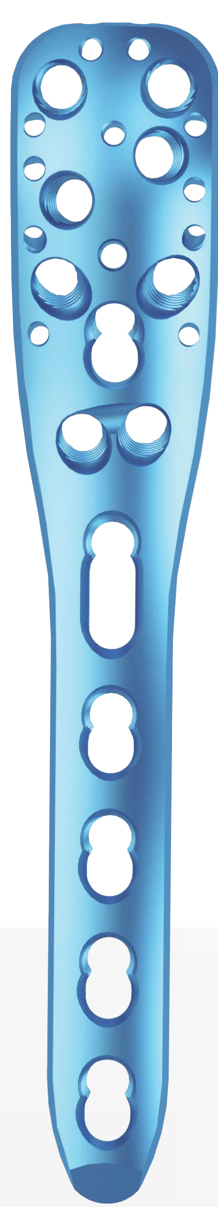
LCP Proximal Humeral Plate