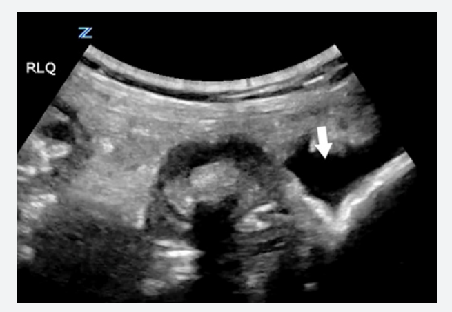
Figure 4. Free fluid (arrow) adjacent to the appendix.