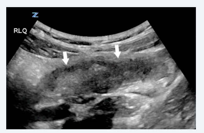
Figure 1a. Large inflamed appendix filled with heterogeneous fluid (arrows).

Sagittal section through the lower abdomen revealed a large, dilated, thick-walled appendix filled with heterogenous fluid. (Figure 1) Small punctate echogenic foci were noted within representing microbubbles that are common in emphysematous inflammatory states. (Figure 2) Additional sonographic findings included a large calculus within the appendiceal lumen (appendicolith) and a small amount of complex free fluid in the periappendiceal space. (Figures 3 and 4) All of these sonographic findings were consistent with acute ruptured appendicitis and the patient was urgently transported to the surgical suite. Operative examination confirmed the diagnosis of gangrenous appendicitis with microperforations. The diseased appendix was removed and the postoperative course was unremarkable. Had the child been released from the ED based on the results of the initial ultrasound examination, catastrophic sequelae surely would have ensued.