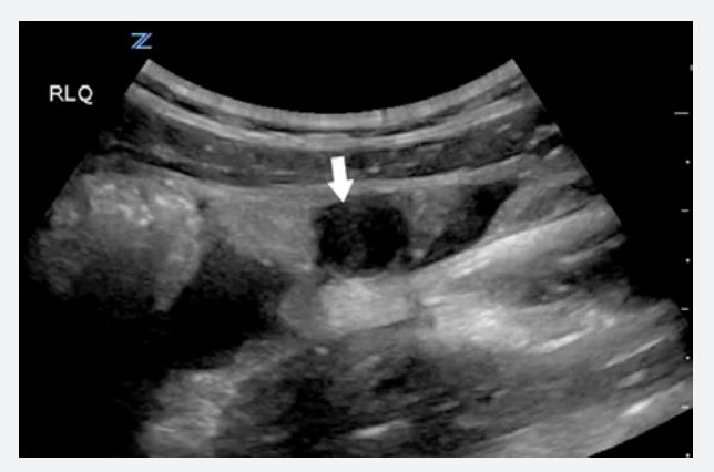
Figure 1b. Transverse section through the same area.