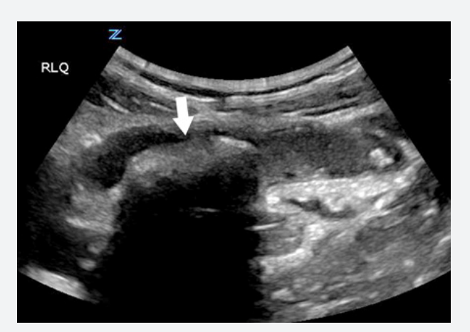
Figure 3. Large calcified appendicolith (arrow) in a large, inflamed appendix.

Successful and accurate bedside ultrasound imaging in emergency medicine requires uncompromised image quality, portability, and ease of use. Unfortunately, most hardware-based beamforming ultrasound systems have a tradeoff between image quality and portability, which can have serious diagnostic consequences. ZONE Sonography Technology, however, is the first software-based image formation process to guarantee unparalleled focus and clarity across the entire image, supporting the most accurate diagnosis possible. The Z.One PRO, like all of ZONARE's products, combines premium imaging with both portability and ease of use, critical components in bedside ultrasound examinations.