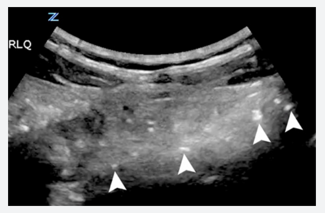
Figure 2. Multiple punctuate echogenic foci within the appendix consistent with inflammatory microbubbles.