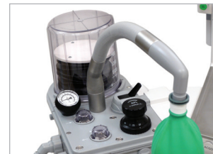
Flexible bag arm

Mindray North America 800 MacArthur Blvd., Mahwah, NJ 07430 Tel: 800.288.2121 Tel: 201.995.8000 Fax: 800.926.4275 www.mindray.com