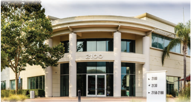
Innovation Center, San Jose, CA

Mindray North America 800 MacArthur Blvd., Mahwah, NJ 07430 Tel: 800.288.2121 Tel: 201.995.8000 Fax: 800.926.4275 www.mindray.com