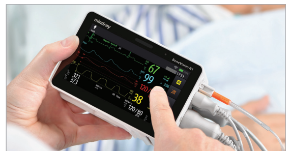
Shared parameter modules, accessories, and common mounting options provide flexibility across the N-Series platform

Serving as both monitor and module, the adaptable N1 provides, continuous monitoring throughout a healthcare facility. Seamlessly integrating into the hospital IT environment, the N1 is a multi-parameter module within the N12, N15, and N17; when removed, it instantly converts to a wireless transport monitor, ensuring a gap-free patient record, from admittance through discharge.