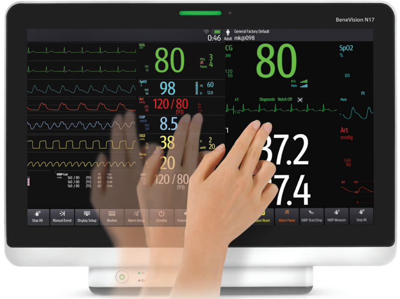
Easily toggle between 2 user configured main screen displays, with just one swipe