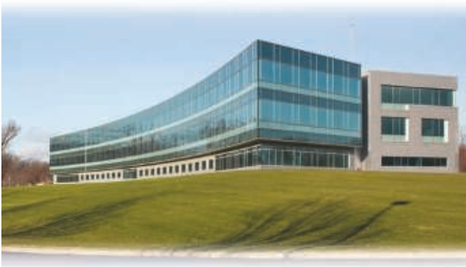
Mindray North America Corporate Headquarters, Mahwah, NJ

Mindray North America is headquartered in Mahwah, New Jersey. Our Ultrasound Innovation Center is located in San Jose, California with additional facilities in Nashville, Tennessee and Seattle, Washington.