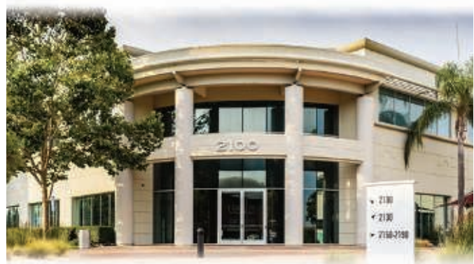
Innovation Center, San Jose, CA

Mindray North America 800 MacArthur Blvd., Mahwah, NJ 07430 Tel: 800.288.2121 Tel: 201.995.8000 Fax: 800.926.4275 www.mindray.com