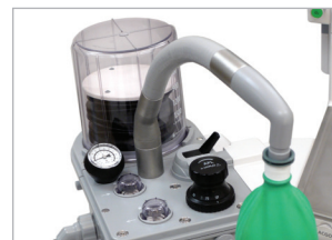
Flexible bag arm

Mindray North America 800 MacArthur Blvd., Mahwah, NJ 07430 Tel: 800.288.2121 Tel: 201.995.8000 Fax: 800.926.4275 www.mindray.com