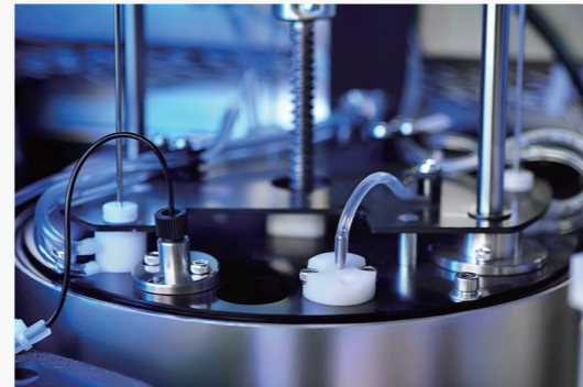
Precise magnetic separation with consistent performance reliability