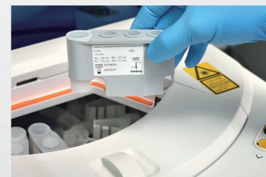
Continuously loading of reagents and consumables