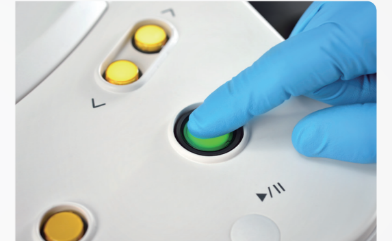
One-key start Extremely easy to use