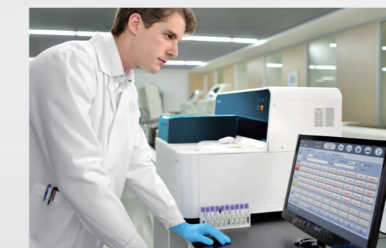
User maintenance free Lighten the workload