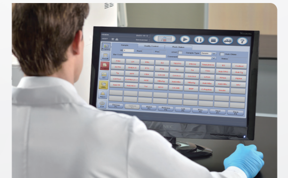
Intuitive software interface Easy access to all functions