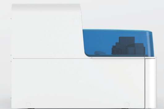
Intelligent consumables management