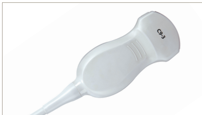
ZONARE PN: Z109-30