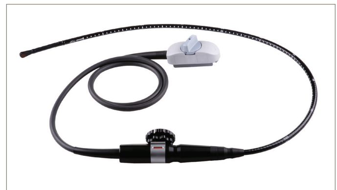
ZONARE PN: Z115-00

Note: Requires Echocardiography option **