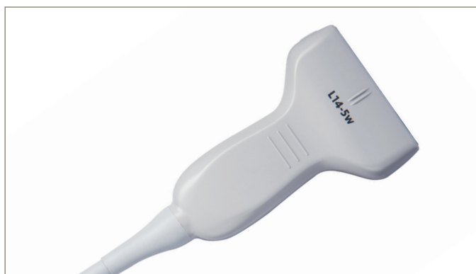
ZONARE PN: Z110-30