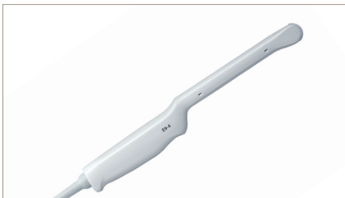
ZONARE PN: Z103-30