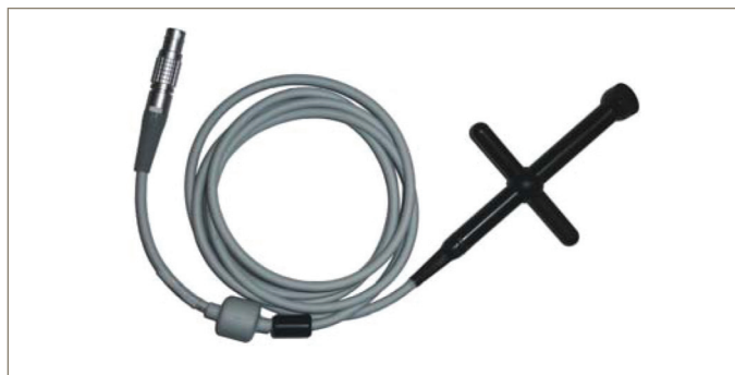
ZONARE PN: Z116-00