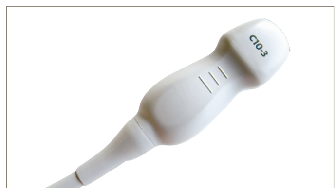
ZONARE PN: Z124-30