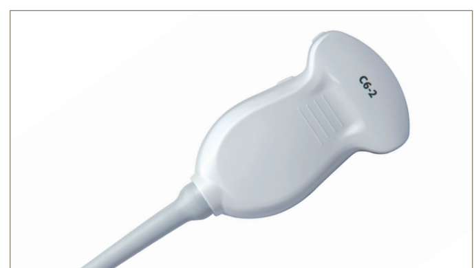
ZONARE PN: Z111-30