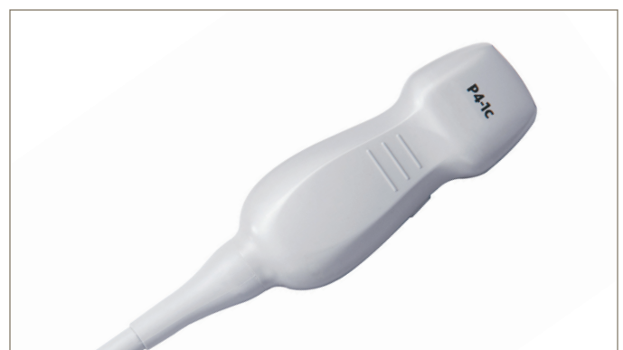
ZONARE PN: Z108-30