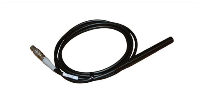
ZONARE PN: Z118-00