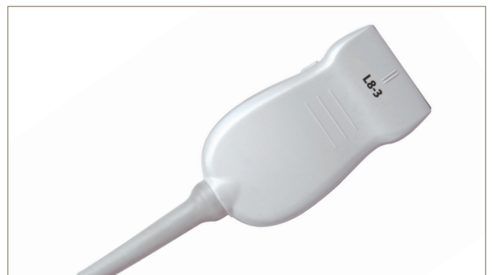
ZONARE PN: Z106-30