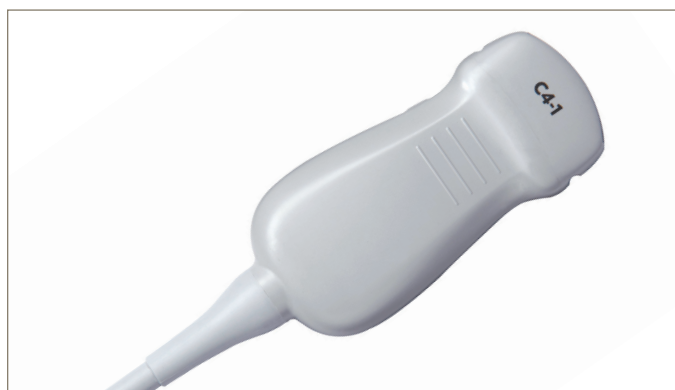
ZONARE PN: Z119-30