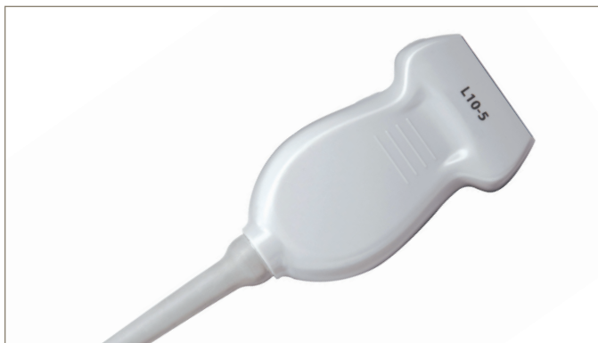
ZONARE PN: Z102-30