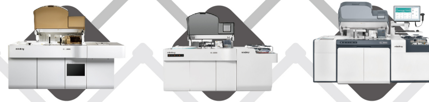
CL-2000i Up to 240 T/H