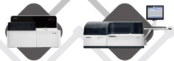
CL-900i Up to 180T/H