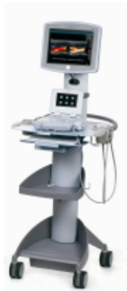
miniCart Ultrasound System

End of life has been reached on the z.one miniCart and SuperCart Ultrasound Systems. This notice affects the ultrasound system. Repair and Technical Support services for current production transducers are unchanged.