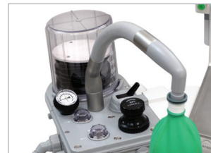
Flexible bag arm