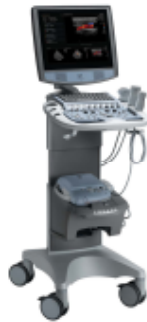
z.one Ultra (SmartCart) Ultrasound System

Presently, Mindray is experiencing some difficulty sourcing replacement parts for systems manufactured before 2011. Please be assured, we remain committed to protecting your investment and are taking all possible actions to secure full support for the SmartCart systems until 2020.