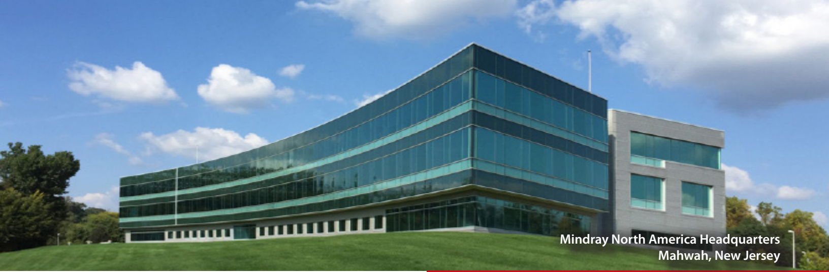
Mindray North America Headquarters Mahwah, New Jersey